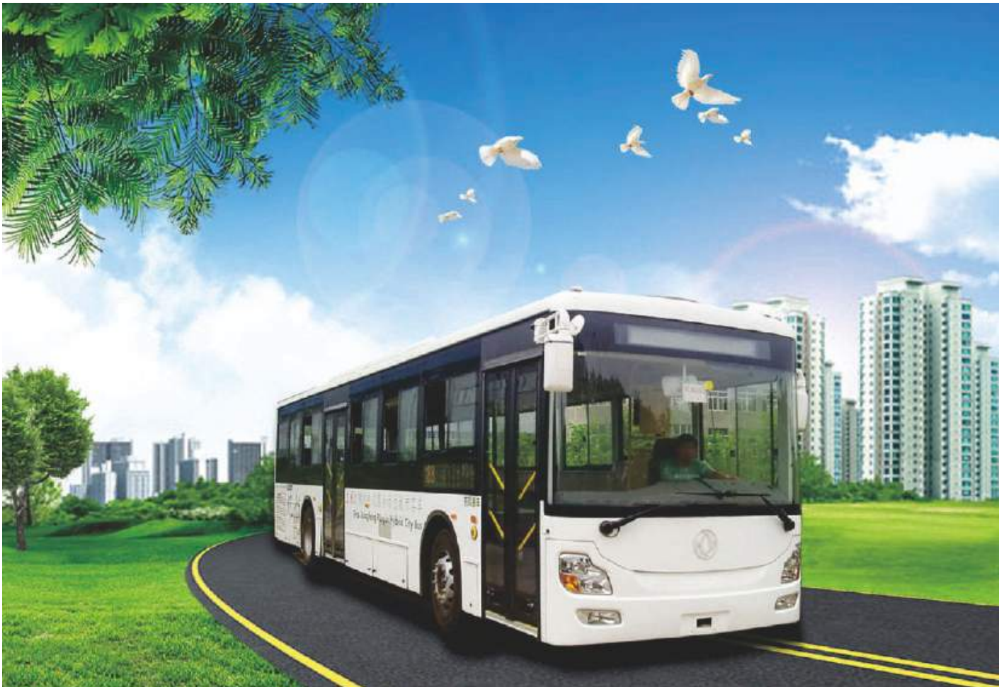
Non Standard Lengths on Request